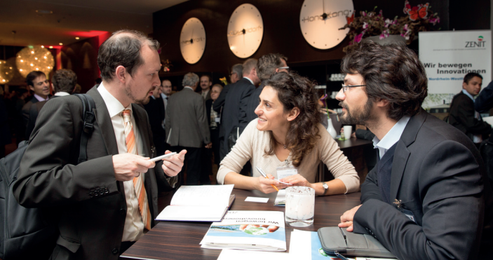
Impression from the 6 th European Networking Event in 2014