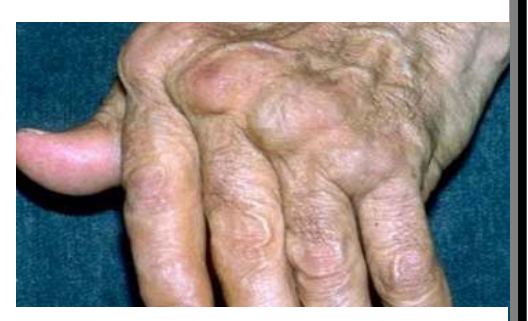
PATHOGENIC FACTORS IN EARLY ARTHRITIS